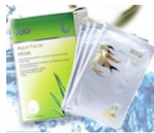
Aqua Face Masks