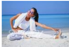
The Sun Ancon Chi Machine maintains health through passive aerobic exercise.